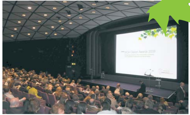
The IVCA Clarion Awards® 2008 in association with Cheerful Scout, were held at the BFI Southbank

The International Visual Communications Association (IVCA) has been in existence for over 40 years and is the largest body of its kind in Europe. It works to identify and promote best communication practice. Mainstream and corporate media both help define our cultural identities and our roles at work and within society. They can inform us about our rights and responsibilities, stimulate ethical debate and explain the contribution we can each make to a better world. The IVCA Clarion Awards® recognise the contribution all art forms and media practice can make in encouraging greater understanding of these vital issues, and advocate active engagement with them.